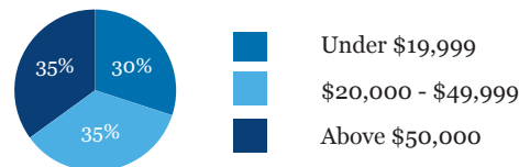
Figure 1. Family Income