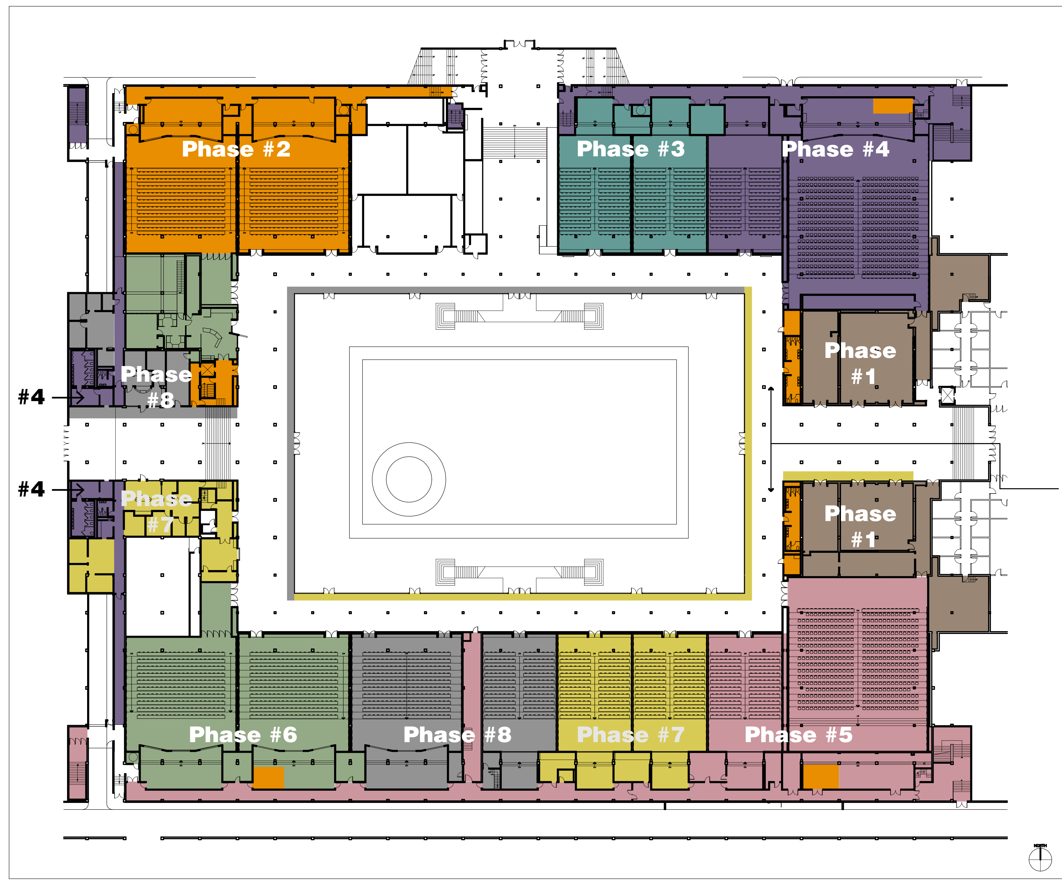
BASEMENT PHASING PLAN SCALE: 1/32" = 1'-0"