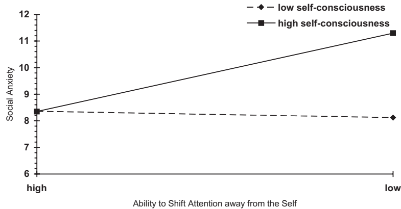
FIGURE 3. Social anxiety for participants at +1 SD and -1 SD in public self-consciousness and ability to shift attention away from the self.

Public self-focused attention, B = .127 , t(110) = 1.31 , ns , self-focus flexibility, B = -.024 , t(110) = .252 , ns , R^2 = .016 , and the interaction between these terms, B = .080 , t(109) = .679 , ns , \Delta R^2 = .004 , were not related to generalized anxiety in this study.