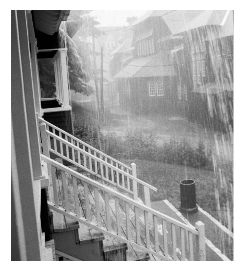
Young Writers | 8

To this day I don't celebrate Easter, and it's easy to see why. I never fully recovered from that fateful day, and I'm constantly reminded of it whenever my mom takes the home videos out for a spin. Pouring it all down on paper doesn't necessarily help me forget it, but it does help with some of the healing.