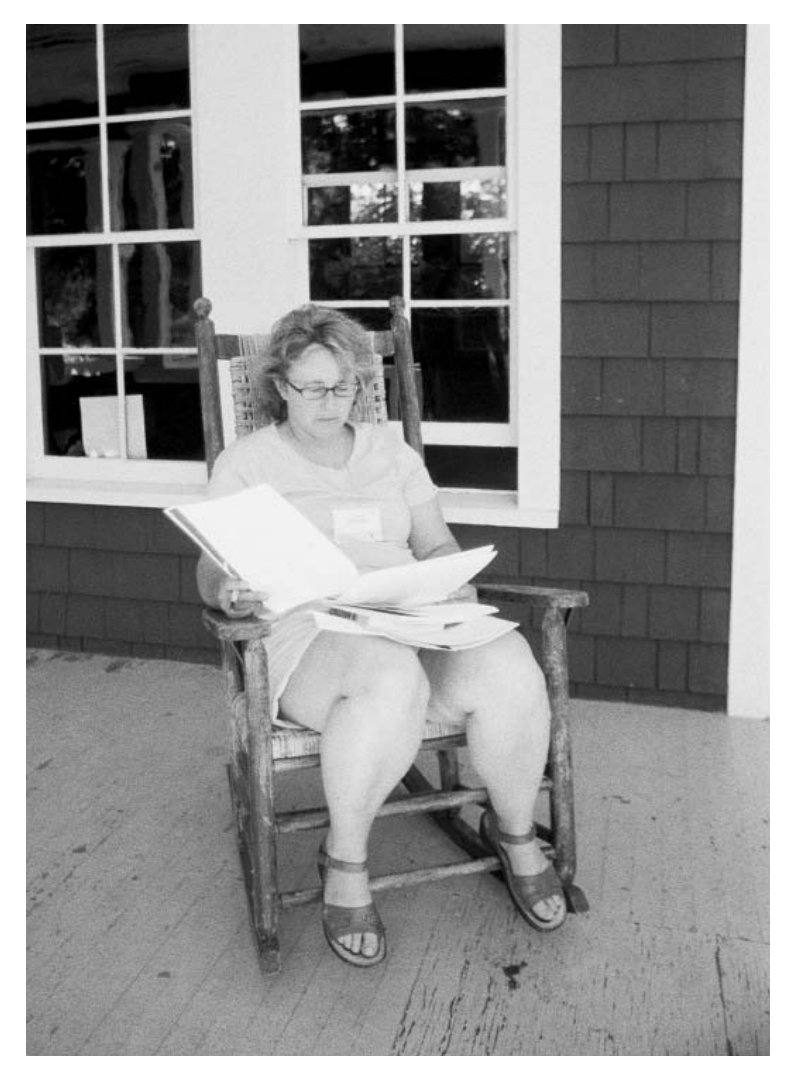
Young Writers |28

Without another sign, he turned around again and padded down the hill and away, leaving me sitting there, with only my lonely moon for company. ■