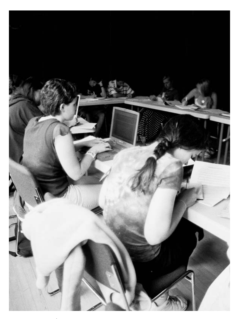
Young Writers | 26

I sat down on the crest of the hill, which smelled so rich of moist grasses, fertile soil, pine trees, and small vermin. Those things were wonderful to the senses, but it was instead the moon that always captivated me. It was almost full tonight, but wouldn't be truly full