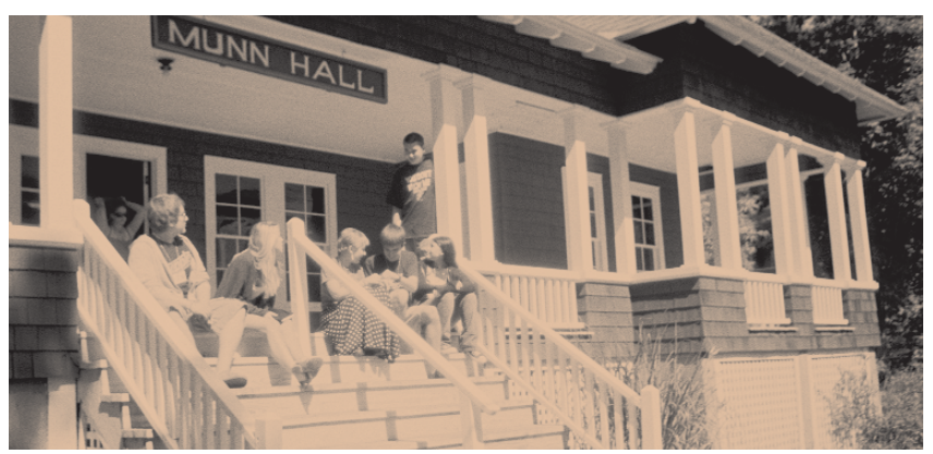
Young Voices: An Anthology of Student Work