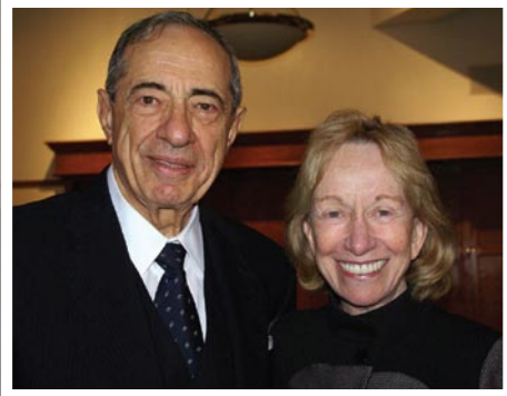
Guest Speakers: Mario Cuomo and Doris Kearns Goodwin

Here are some photos of the events. Enjoy!