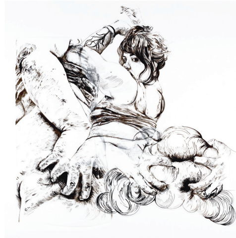
Phoebe Rotter (M.F.A.)