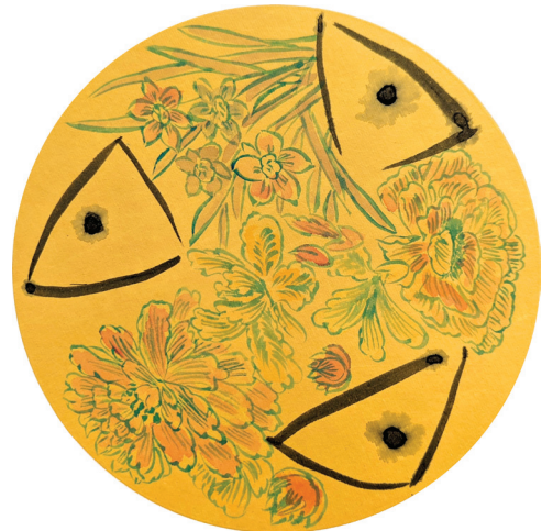
Yin Zhang (MA)