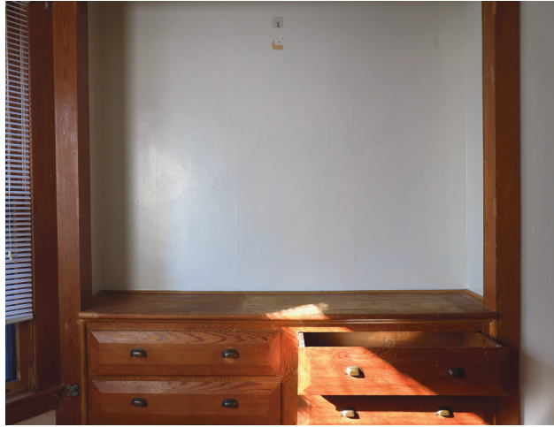
Sara Alonge (MFA)