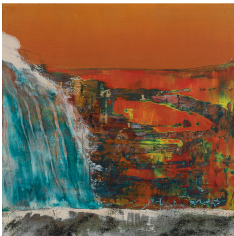
Kit Kelly Yedinak (MA)