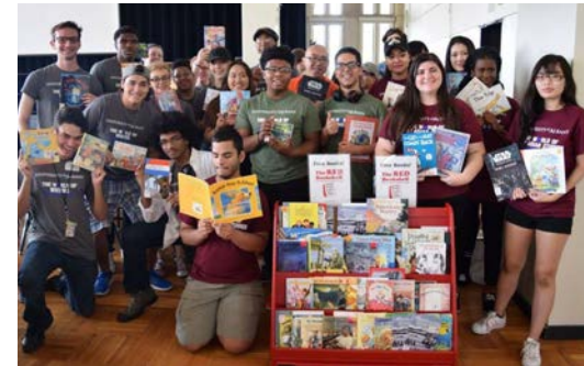
RECOGNIZED FOR SERVICE: UAlbany L-LC students fill a RED Bookshelf with books they refurbished for local children.

educational experience of UAlbany students with its emphasis on continuous improvement and embedding public engagement in the community. ■