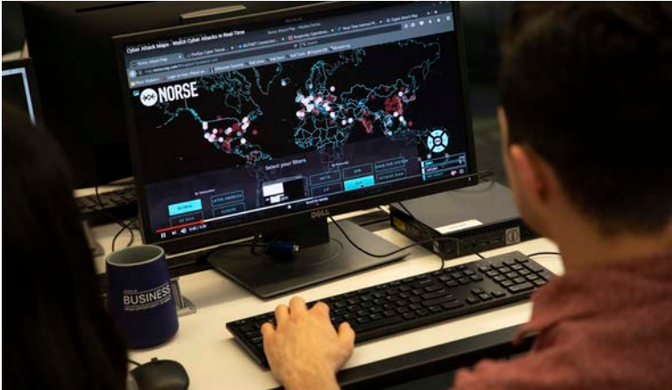
NEW DEGREES: The University added new academic offerings to its extensive portfolio, including a bachelor's degree in Environmental and Sustainable Engineering, and a new interdisciplinary master's degree in Digital Forensics and Cybersecurity.

A plan to increase enrollment in the University's Honors College , through selective recruitment and continued outreach to high achieving high school students, was very successful. While enrollment at the College has remained around 120 students per year, the University invited 249 outstanding students for the 2020-21 school year. And this year's cohort is more representative of the incoming freshman class as a whole, with 45 percent non-white students compared to 28 percent the previous year.