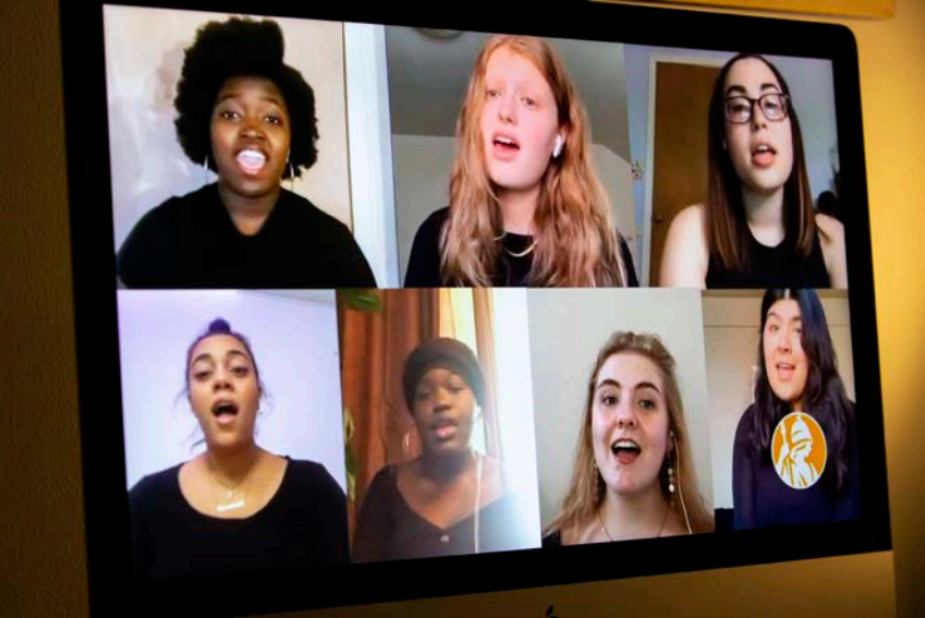
GOING VIRTUAL: UAlbany held a virtual Open House and an online, interactive OneUAlbany Graduation Celebration.

A new UAlbany eSports team launched in October with a competitive video gaming arena in Draper Hall on the Downtown Campus, representing all class years, majors and diverse backgrounds. The team competed with the 57 colleges and universities from 18 states in the Eastern College Athletic Conference and took home two league titles in its first year. The team donated its $5,000 in winnings to the Student Emergency Fund, which supports students facing financial hardships. ■