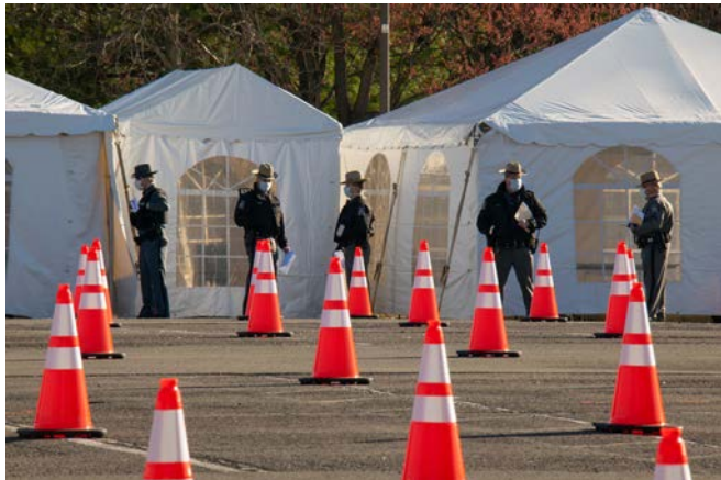
UALBANY BECOMES COVID-19 TEST SITE: In cooperation with New York State, the University at Albany converted a parking lot on its Uptown Campus into a COVID-19 drive-through testing site in April 2020.

When the pandemic hit, UAlbany supported the community in a wide variety of ways. Students, faculty and staff from both the College of Engineering and Applied Sciences and the College of Emergency Preparedness, Homeland Security and Cybersecurity collaborated to design, 3D-print and assemble more than 7,500 protective face shields for frontline medical personnel facing shortages of personal protective equipment. Various University entities also supported the needs of healthcare workers with donations of gloves, masks and gowns.