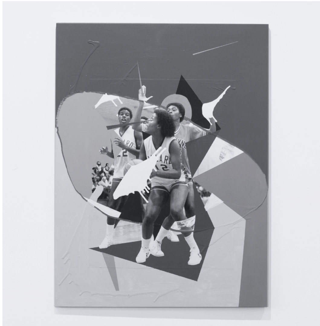
Ashley Teamer, Mid Eighties , 2018, acrylic, Flashe and latex paint over inkjet print on plywood

Every Wednesday at noon, July 3 – December 4.