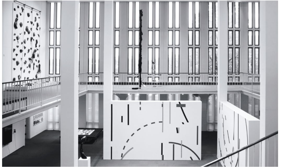
ACE: art on sports, promise, and selfhood (installation view)