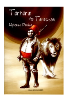
Alphonse Daudet, Tartarin of Tarascon (Paris, 1872)