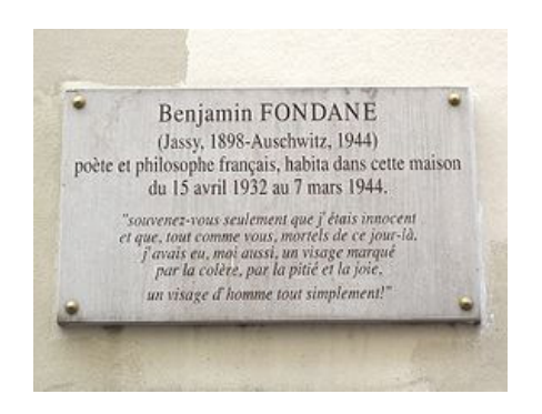
Plaque in memory of Benjamin Fondane, Rue Rollin 6, Paris