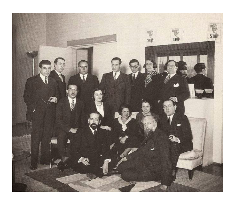
Sur Editorial, 1940.