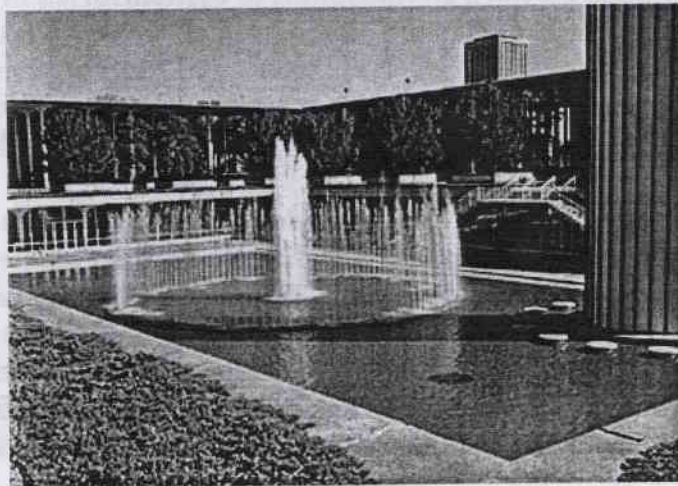
Center of the University Campus