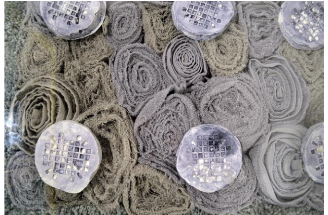
Madison LaVallee LR/KIT/LAV/OLS (detail 6), 2015 Wood, paint, yarn, memory foam, bricks, plaster, fabric, glass, a living plant 6 x 6 x 2 feet

For further information on exhibitions and programs, call (518) 442-4035 or visit our website at www.albany.edu/museum .