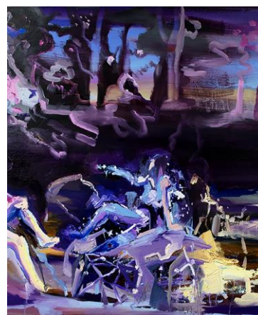
Berly Brown Communion (detail) , 2016 Oil on canvas 84 inches x 76 inches