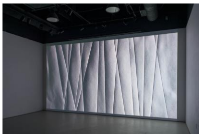
Kyle M. Contestabile No. 84 , 2017 Video projection Dimensions variable