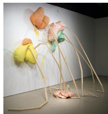
Samuel W. Negrich Hustle & Poise , 2017 Plastic, pigmented latex, spandex, pine, nylon 12 x 18 x 6 feet