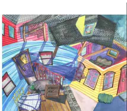
Theresa McTague Detached Roof Room , 2017 Gouache and watercolor on paper 12 ½ x 15 inches

For further information on exhibitions and programs, call (518) 442-4035 or visit our website at www.albany.edu/museum .