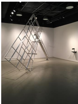
Matt Crane Avoidance Attractor , 2016 Welded aluminum 156 x 168 x 30 inches