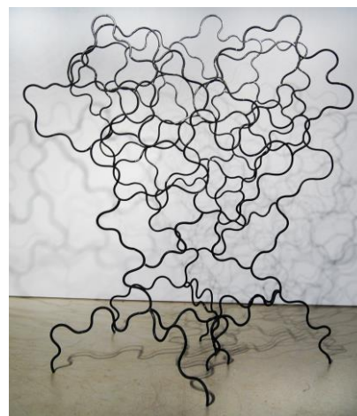
David Reisine Puddles in Space , 2016 Steel installation Dimensions variable