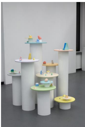
Christine Snyder Nine , 2015 Terracotta clay, acrylic paint, latex paint, wood, mdf, cardboard, air dry clay, sandbags, glue, pvc pipe Dimensions variable