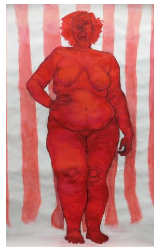
Lacey L. Dickerson Ring Leader , 2015 Mixed media on paper 105 x 60 inches