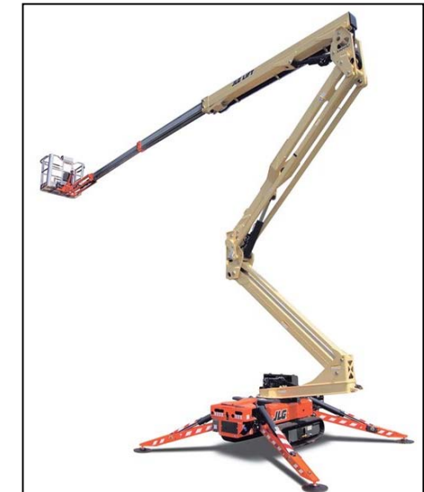
Compact Crawler Boom Lift