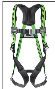
Full Body Harness