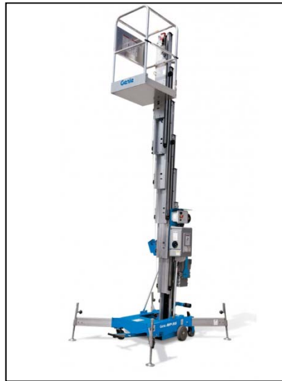
One-Person Vertical Lift