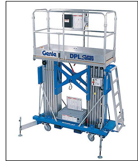
Two-Person Vertical Lift