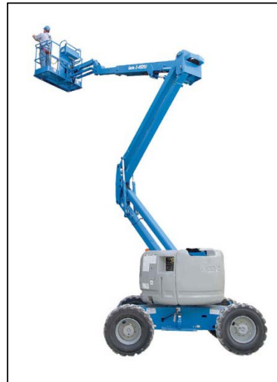
Articulated Boom Lift