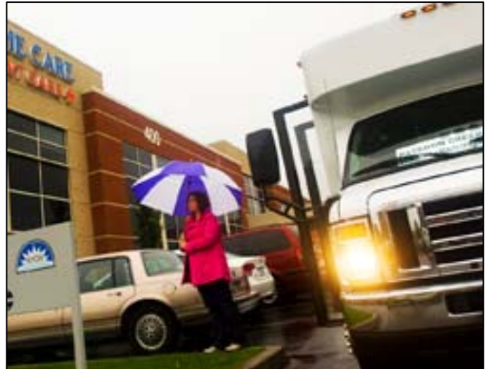
A UAlbany student takes the new Health Center shuttle bus to the Patroon Creek Boulevard location.

"An overall highlight of being in Student Affairs is that it taught me a lot of the student experience and it provided me with a great deal of self confidence. I had the pleasure of meeting different people each day, as no two work days were ever the same. Although there were many memories, my fondest was the day I went for a ride on a camel at Collins Circle (Secretaries Day)."