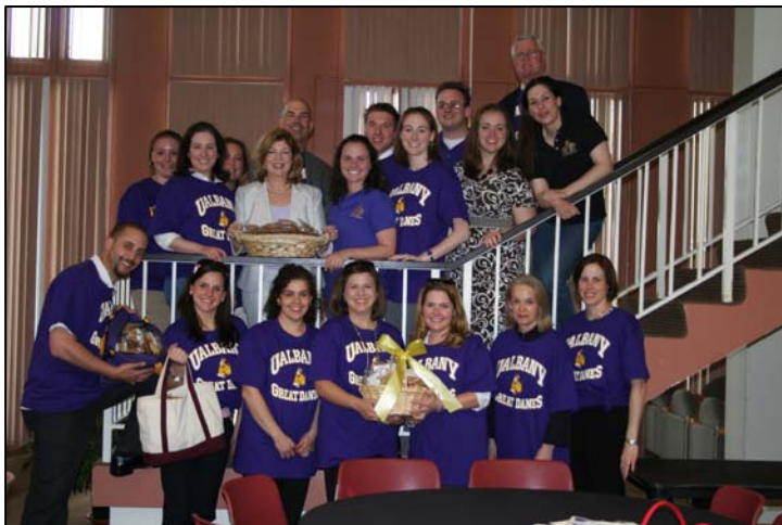
UAlbany faculty and staff, together with the Spirit Committee, distributed nearly 2000 cookies on Reading Day in May 2008 as part of "Cookie Day."