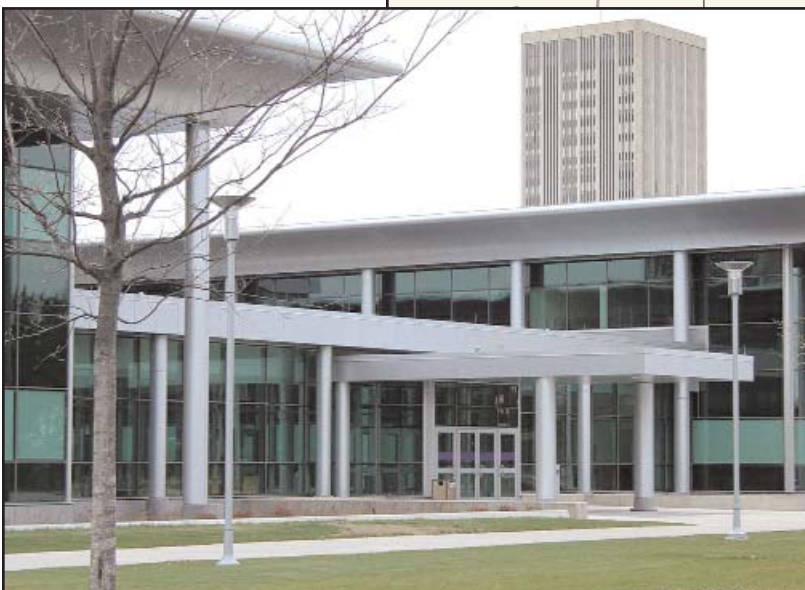
University at Albany Life Sciences Building