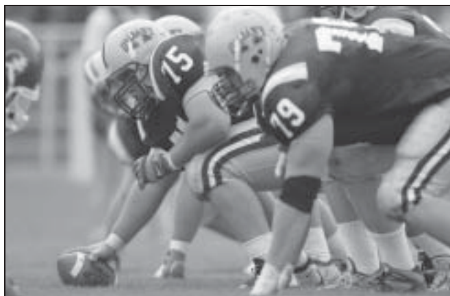
UAlbany's offensive line helped the program lead the Northeast Conference in rushing for the sixth consecutive season.