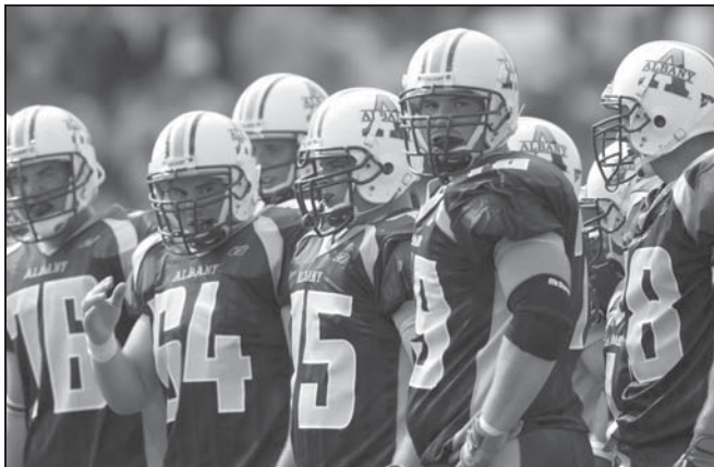
UAlbany's offensive line paved the way for a unit that established the Northeast Conference's single-season rushing record in 2003.