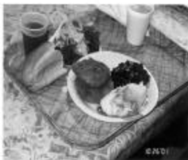
Collard Greens & Spinach Salad from CSA