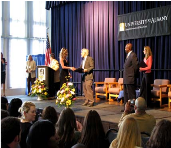
May 2007 Recognition Ceremony