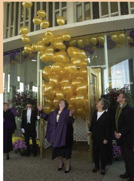
Dedicating new space for the College of Arts and Sciences