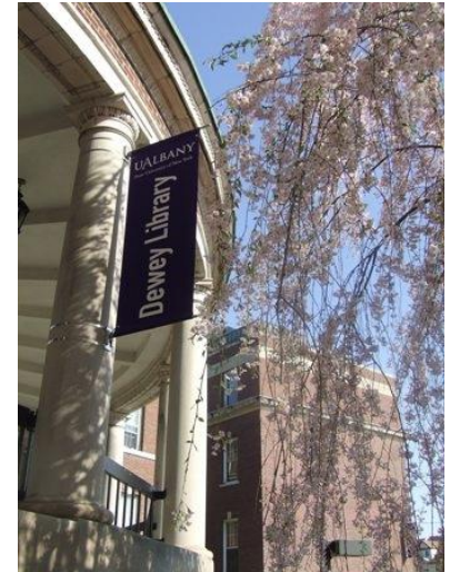
Dewey Graduate Library

Access to excellent library facilities is essential for a successful graduate education. At UAlbany, we have three libraries that support your learning and scholarship