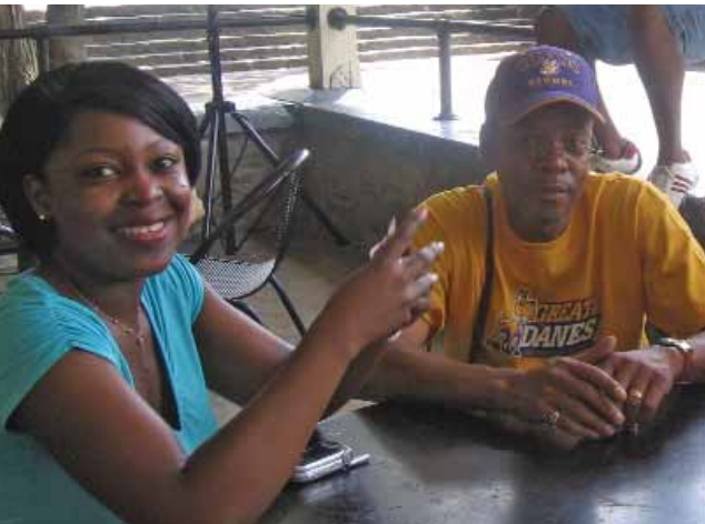
◀ EOP alumni enjoy their reunion in Atlanta.