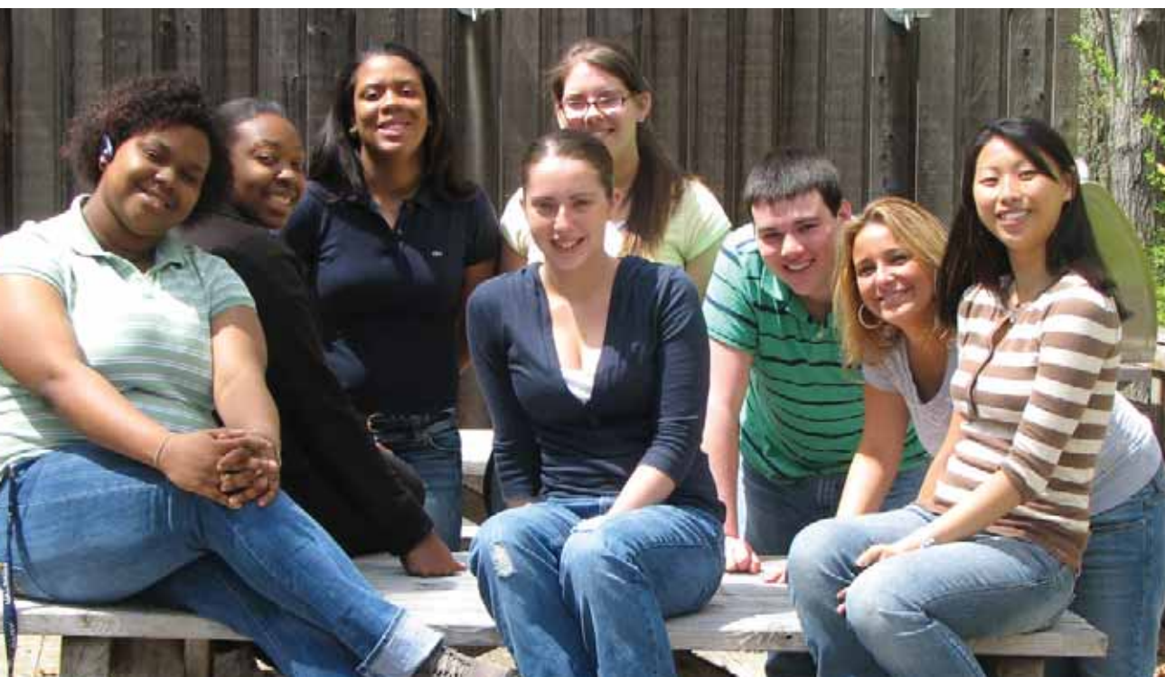
◀ Current UAlbany students learn about the Alumni Association as they take in some sunshine on the Alumni House deck.